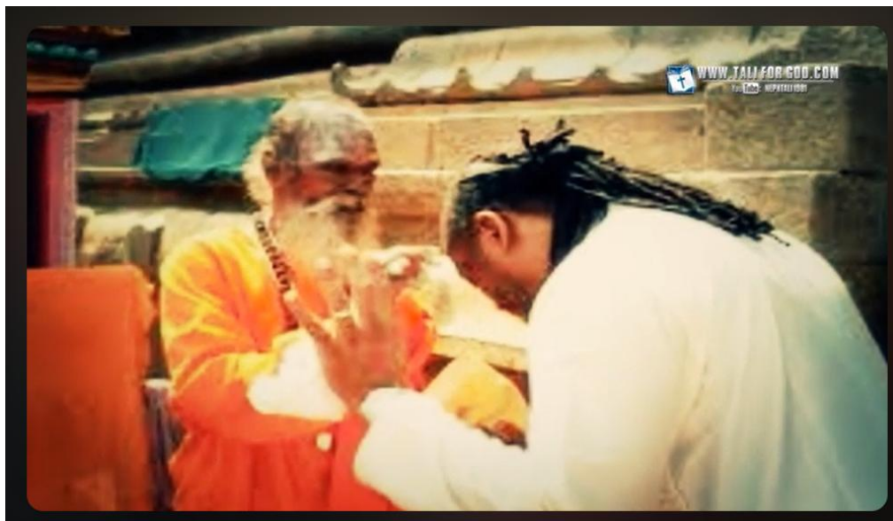
Performing Hindu rituals

There are those that push back when you begin to expose false teachers and false prophets saying exactly what the guy on video said, they say you are coming against God's anointed. When they are false, then you certainly are not coming against anything godly. I didn't used expose false prophets, false teachers and such but there came a day when God pushed me to start doing it because we must expose these wolves in sheep's clothing. I am required to warn and protect my flock. To help you to have eyes to see this for yourself.