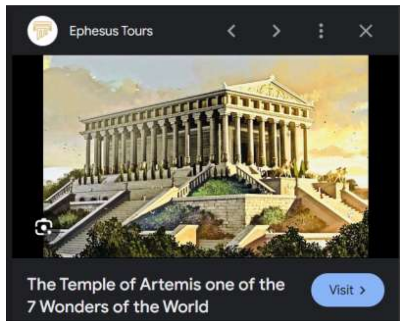
The temple of Artemis – one of the 7 wonders of the world. This is a modern day rendition of what her temple may have looked like.

Let's take a look at some research regarding The Temple of Artemis who is also called Diana. This temple was located at Ephesus.