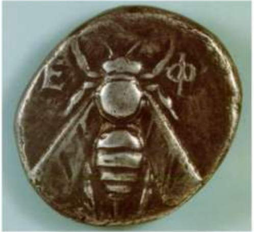
Ephesian Artemis and Queen Bee reliefs on a coin

The temple of Artemis was administered by only a few priests. The male organs of these priests and the head priest called Megabysos were removed. According to Strabo, the priests were chosen from the middle of Anatolia and especially from the east. Becoming Megabysos meant assuming a very honorable duty. The assistants of Megabysos were virgins similar to the Vestal Virgins of Rome. Some say that the worship of Artemis, the Temple of Artemis and the religious hierarchy were all modeled on the social structure of bees. The bee was the symbol of Ephesus, and it is often seen on coins and statues in Ephesus. It was a symbol of Artemis – the queen bee.