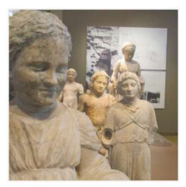
Statues of children from the sanctuary of Artenin at Brauron, Attica, site of an ancien probaruses

Statues of children from the sanctuary of Artemis at Brauron, Attica, site of an ancient orphanage. Supposedly these statues were donated by thankful parents who believed that Artemis had helped them in childbirth to have a child.