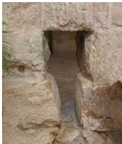
Needle gate (eye of a needle) going into Jerusalem

It's pretty obvious that Jesus didn't mix His words about a rich person getting into heaven. Many people don't even state the obvious that a camel can never go through the eye of a needle. So why would Jesus say that? In studying to see what that is you will find that when the cities had walls around them in addition to the big city gates that were usually opened during the day, there was a small hole type of gate that they called the needle gate and this is what Jesus was referring to when He spoke of the "eye of the needle." If someone was coming into the city after the gates were closed they would have to come through this gate. Usually it was so small that they would have to unpack the camel, taking all of his goods and packs off of him. Then the camel would have to kneel to get through the small opening. Some believe this is a picture of humbling oneself and even shedding or not clinging to their riches.