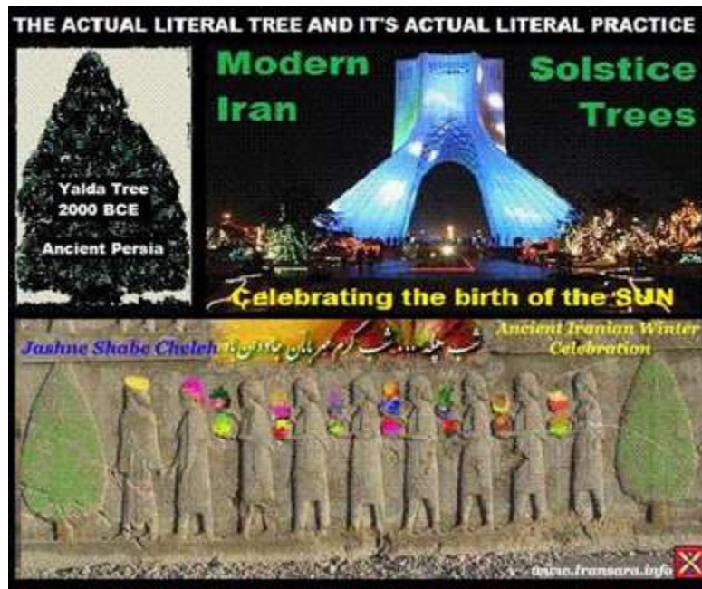
The actual literal tree and its actual literal practice. Top L: Yalda tree, ancient Persia 2000 BC. Top R: Modern Iran Solstice Trees – celebrating the birth of the sun. Bottom: Ancient Iranian Winter Celebration.

Trees and groves have been objects of worship through many centuries and many cultures. It has been believed that trees contain sacred energy and represented gods and goddesses of pagan religions. Many of the winter solstice celebrations such as Mithra, Yalda, Yule, Saturnalia, Christmas and Hanukkah all have similar practices and traditions involving a tree. Within the Scriptures you will often find tree worship associated with the fertility goddess Asherah.