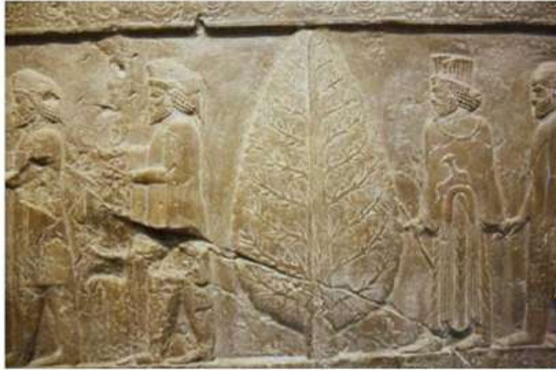
Relief carving at Persepolis, ceremonial capital of the Achaemenid Empire, depicting Mithra and an evergreen tree.

Relief carving at Persepolis, ceremonial capital of the Achaemenid Empire, depicting Mithra and an evergreen tree. Mithra was their sun god and the tree was his sacred tree.