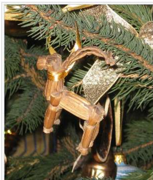
A Yule goat on a Christmas tree.