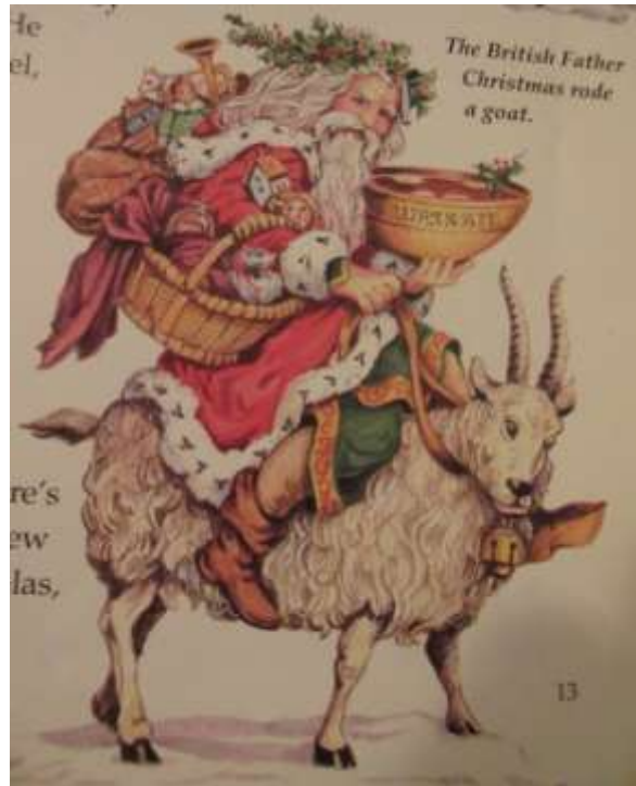
The British Father Christmas rode a goat. Here he is with his wassail bowl and all.