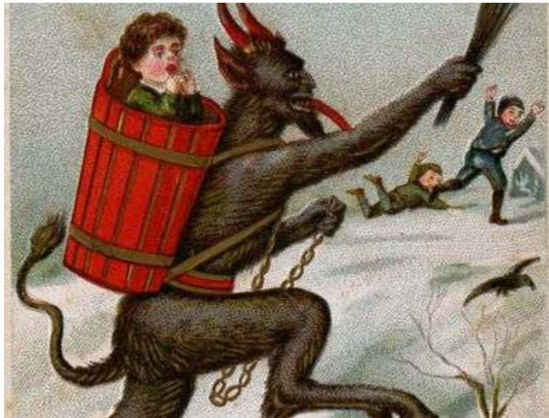
Krampus pictured on an Austrian postcard from 1910. He has one child captured and he's chasing down some more.