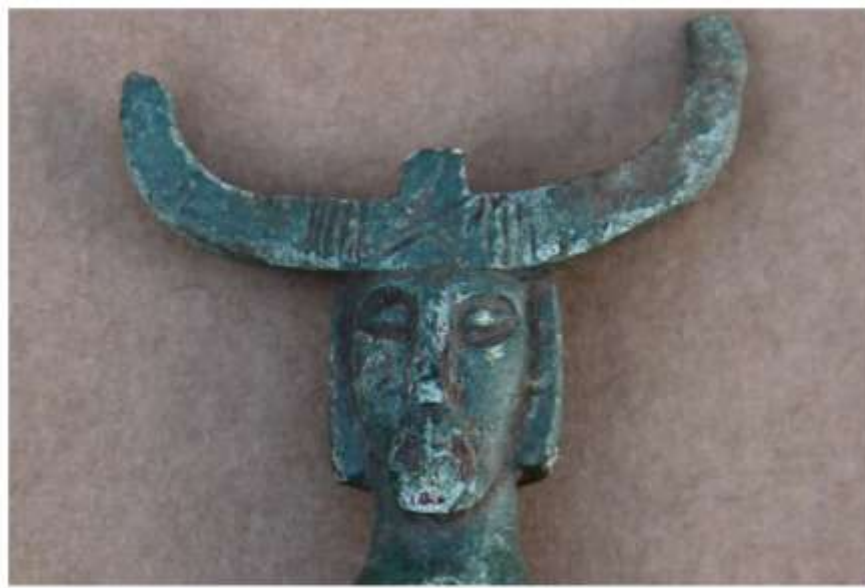
Odin from Mesinge

Cernunnos, the Celtic "Horned God" of wild things, fertility, and nature. Often depicted with stag antlers, he was revered as the lord of the forest and a mediator between humanity and the wild. Sometimes cernunnos is depicted as part human and part animal with hooves like the baphomet.