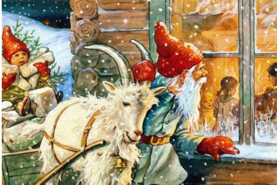
Another depiction of the santa figure with a goat pulling his sled.