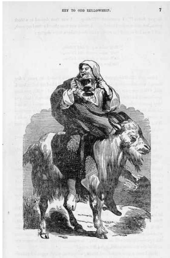
Key to Odd Fellowship. The Independent Order of Odd Fellows is a secret society much like Freemasonry. Here we see an old man riding a goat holding a wassail bowl.